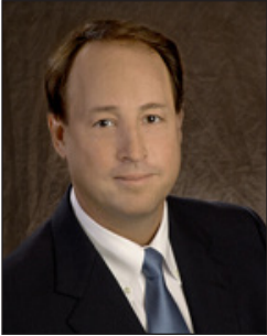
Stuart, Florida 772.286.9881