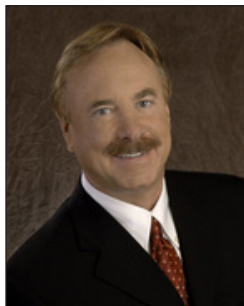
West Palm Beach, Florida 561.686.5005