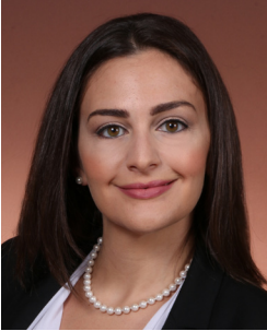
Fort Lauderdale, Florida Phone: 954.763.3200